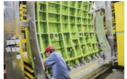
A Kawasaki manual operator working with a Boeing 777X cargo door.