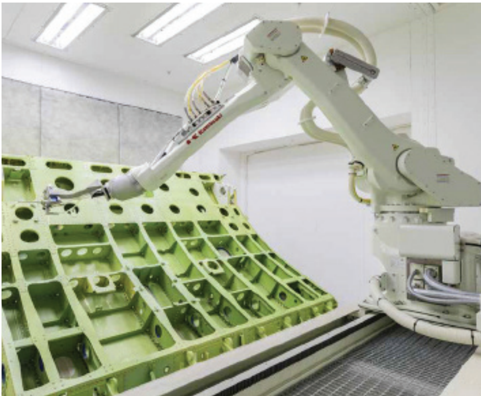
The manufacturing of Boeing 777X cargo doors with Kawasaki's automated manufacturing systems.