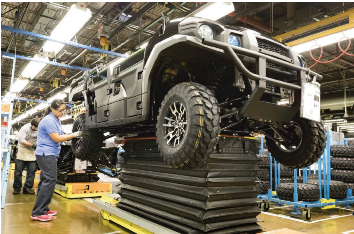
Part of Kawasaki Lincoln's production line for MULE utility vehicles.