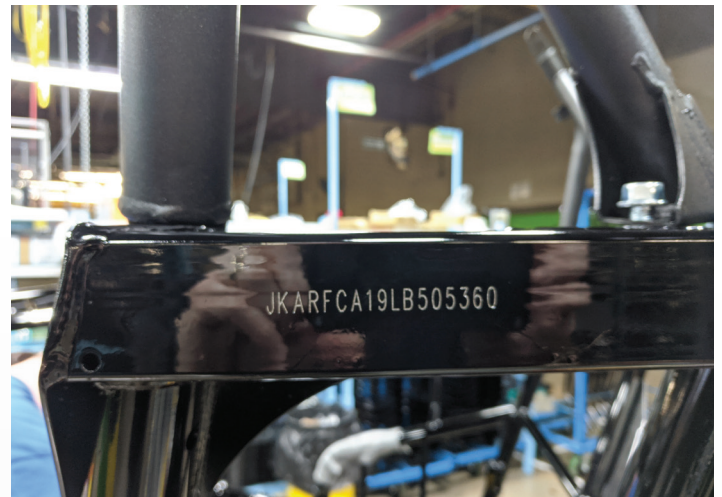
Kawasaki’s laser engraving system etches vehicle identification numbers (VIN) onto vehicle frames with a 3D printed clamp (left).